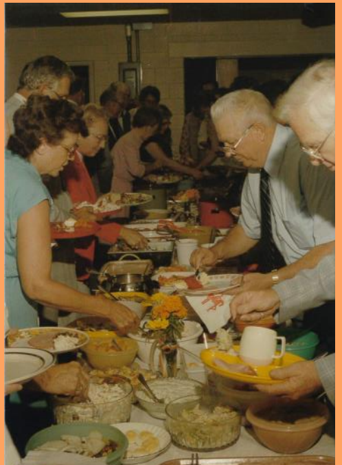
Pictured: SUMC Pitch-Ins from the past!