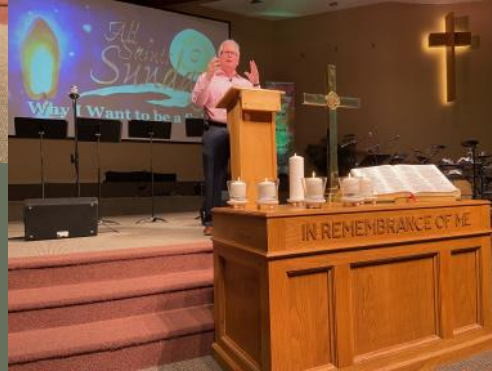
The choir and All Saints Day on the bottom row.